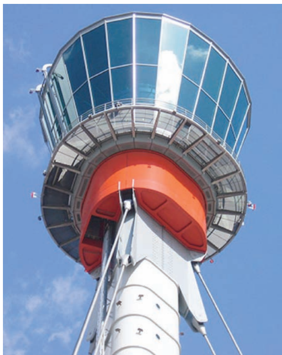
London Heathrow Air Traffic Control Tower

As a result of the high performance of the original MDS system, NATS expanded the system to provide surface surveillance for the area surrounding a new air traffic control tower and for the airport's growth associated with Terminal 5. At Heathrow, MDS is covering the entire airport and gate areas with 23 sensors – an example of MDS' ability to achieve outstanding surveillance coverage with a highly efficient number of sensors for reduced life-cycle cost. Further, through its compatibility with developing concepts such as Automatic Dependent Surveillance – Broadcast (ADS-B), Sensis MDS provides a bridge to future technologies.