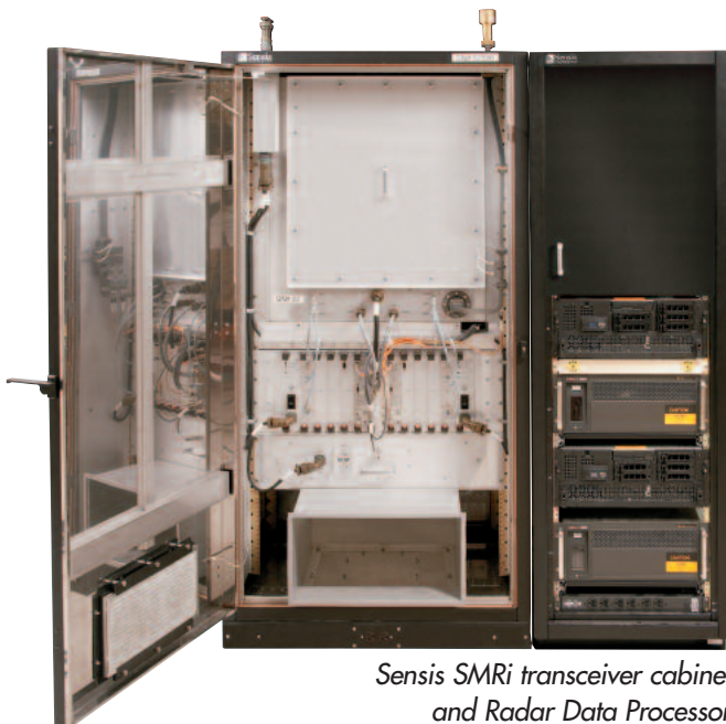
Sensis SMRi transceiver cabinet and Radar Data Processor

Minimizes System Obsolescence – with an open architecture design, COTS hardware and software