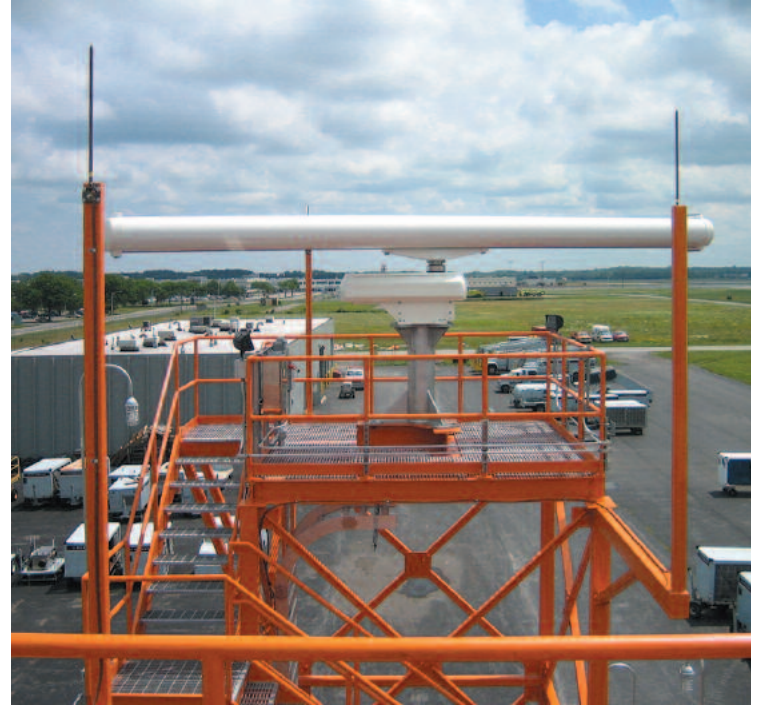
Sensis SMRi antenna

The ability to see all aircraft and surface vehicles in any weather condition – including heavy rain – is essential for accurate airport surveillance and safe airport operations. Sensis high-performance surface movement radar (SMRi) is the most advanced radar available for accurately identifying aircraft and vehicles on the airport surface. The X-Band SMRi features high resolution and frequency diversity to decrease the clutter cell size. Additionally, advanced signal processing techniques continually adapt to changing weather conditions for seamless weather performance and advanced clutter suppression. Even in very high rainfall rates and for the highest detection probability requirements, Sensis SMRi provides up to 40% more detection range than other surface movement radars. Further, Sensis SMRi features fully solid state transmitter technology for exceptionally high reliability and ease of maintenance and an open architecture COTS design to protect against obsolescence.